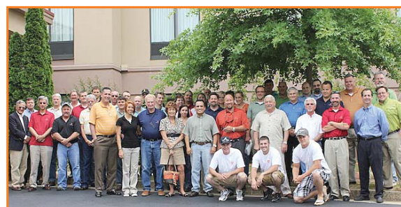
The Primus Team at the 2011 Company Meeting