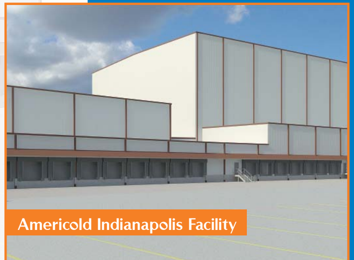
Americold Indianapolis Facility

The project is slated to be completed in late 2011, approximately one year from project kickoff. Primus has previously delivered successful Americold assignments in Salt Lake City, UT; Fremont, NE; Massillon, OH; and Albertville, AL. //