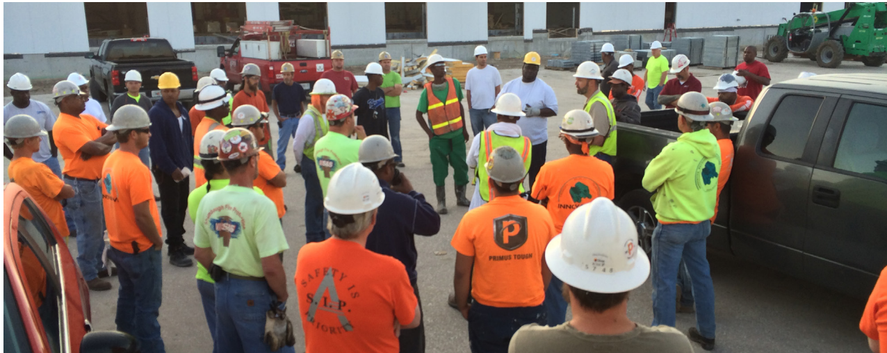
Safety stand down at Primus's Sysco project in Jacksonville, FL.